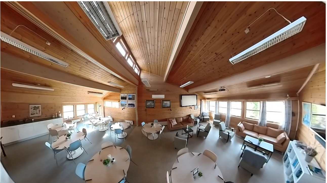
Breakfast area. With larger numbers the serving will be in tent