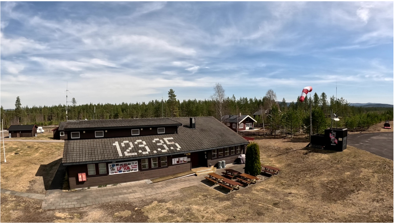
Main building with office and space for social and food