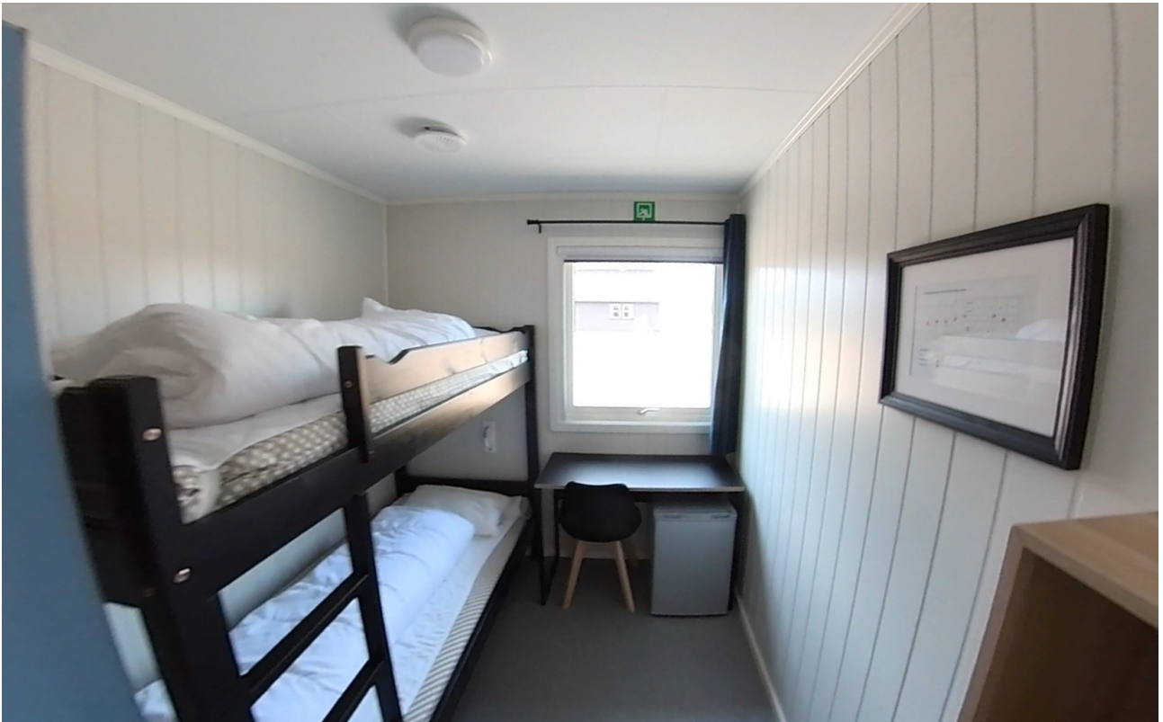
One of the 2 bed rooms available on site