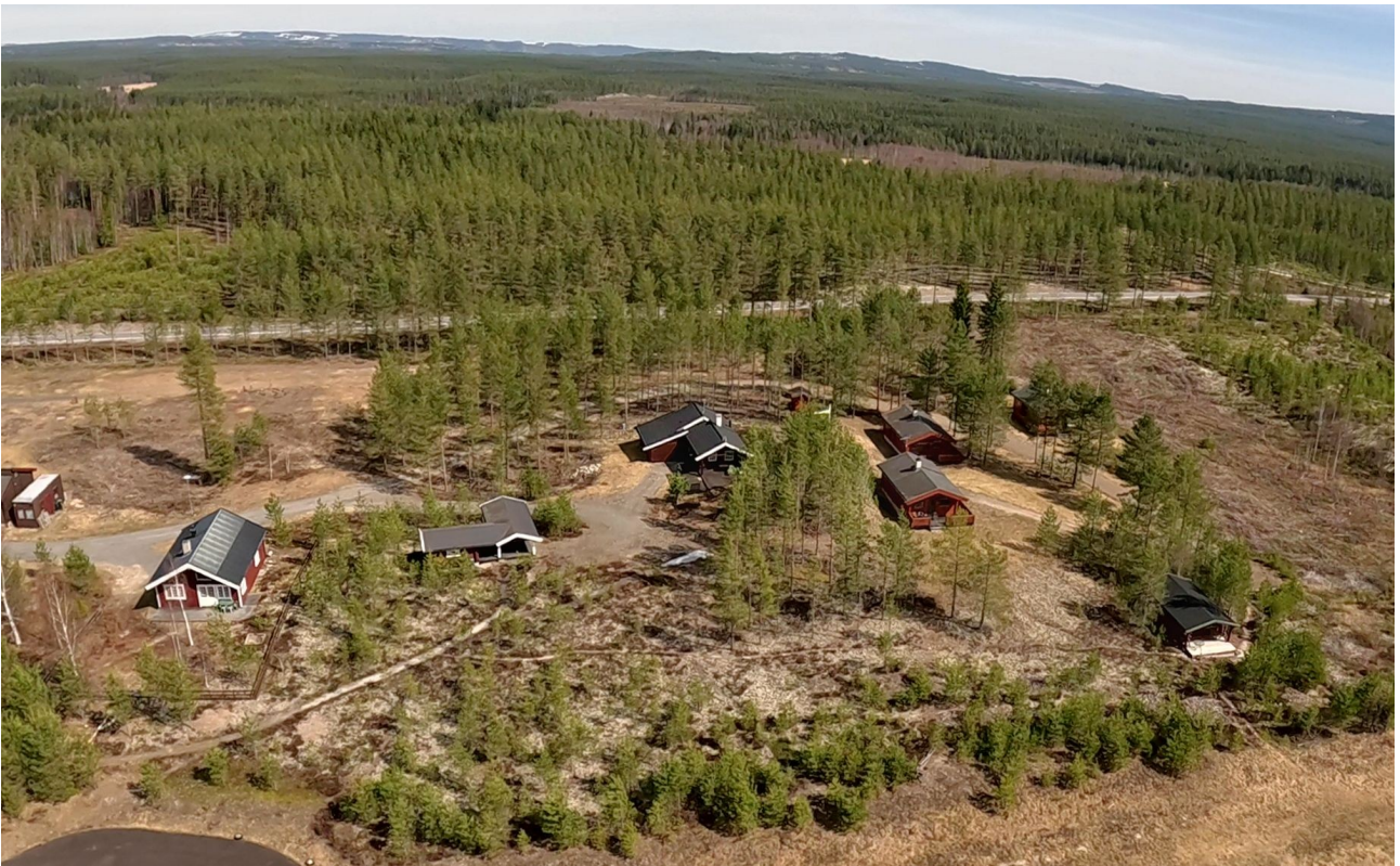
5 cabins on site available (200m from flightline)