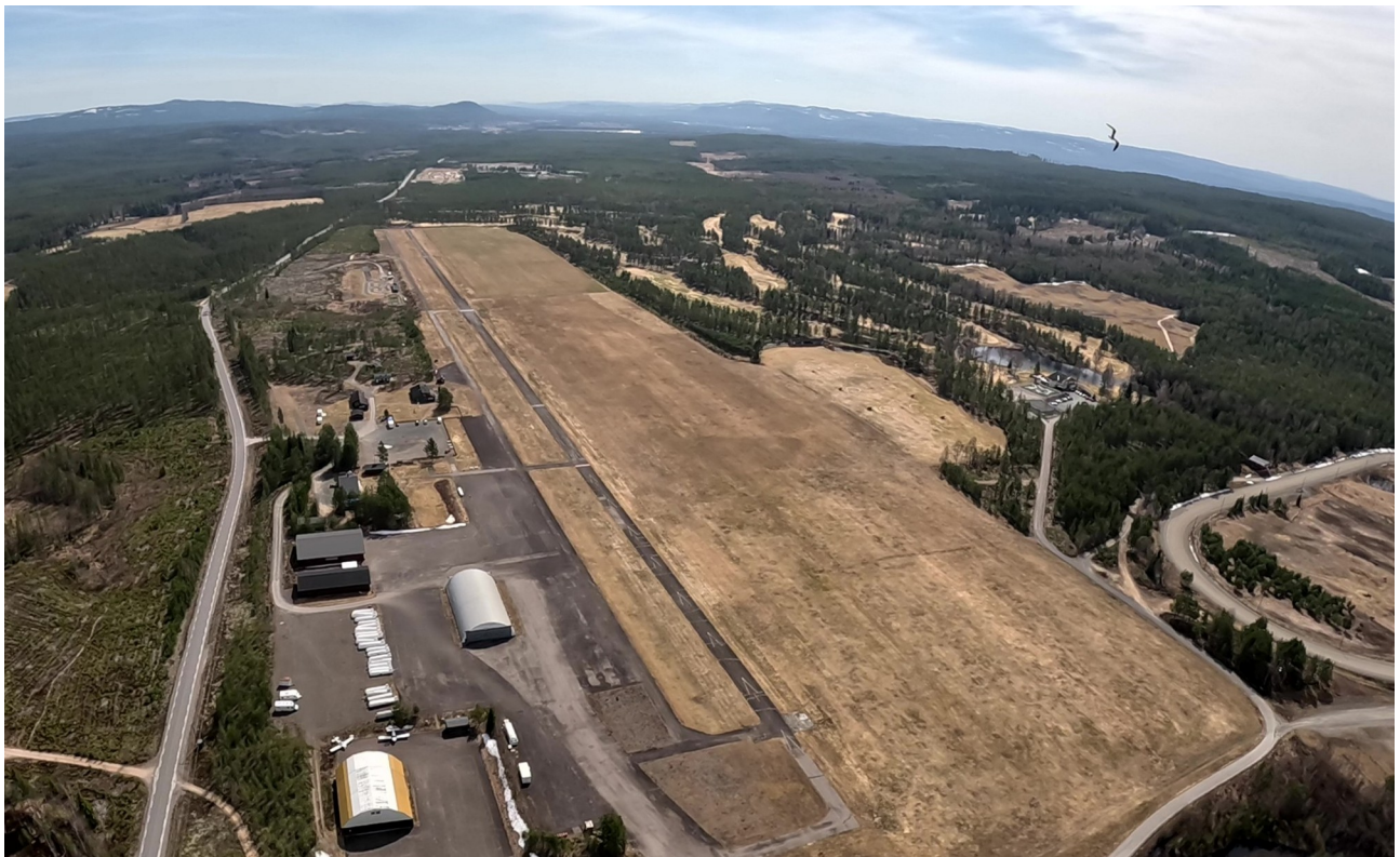
Overview looking south