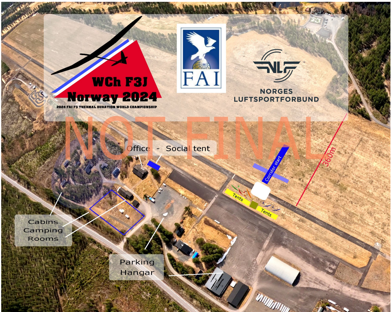
Airfield layout provisional