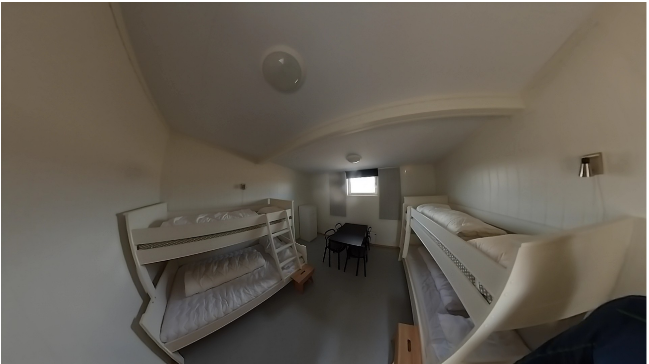
4 bed room on site